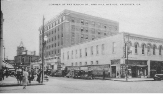
Corner of Patterson Street and Hill Avenue